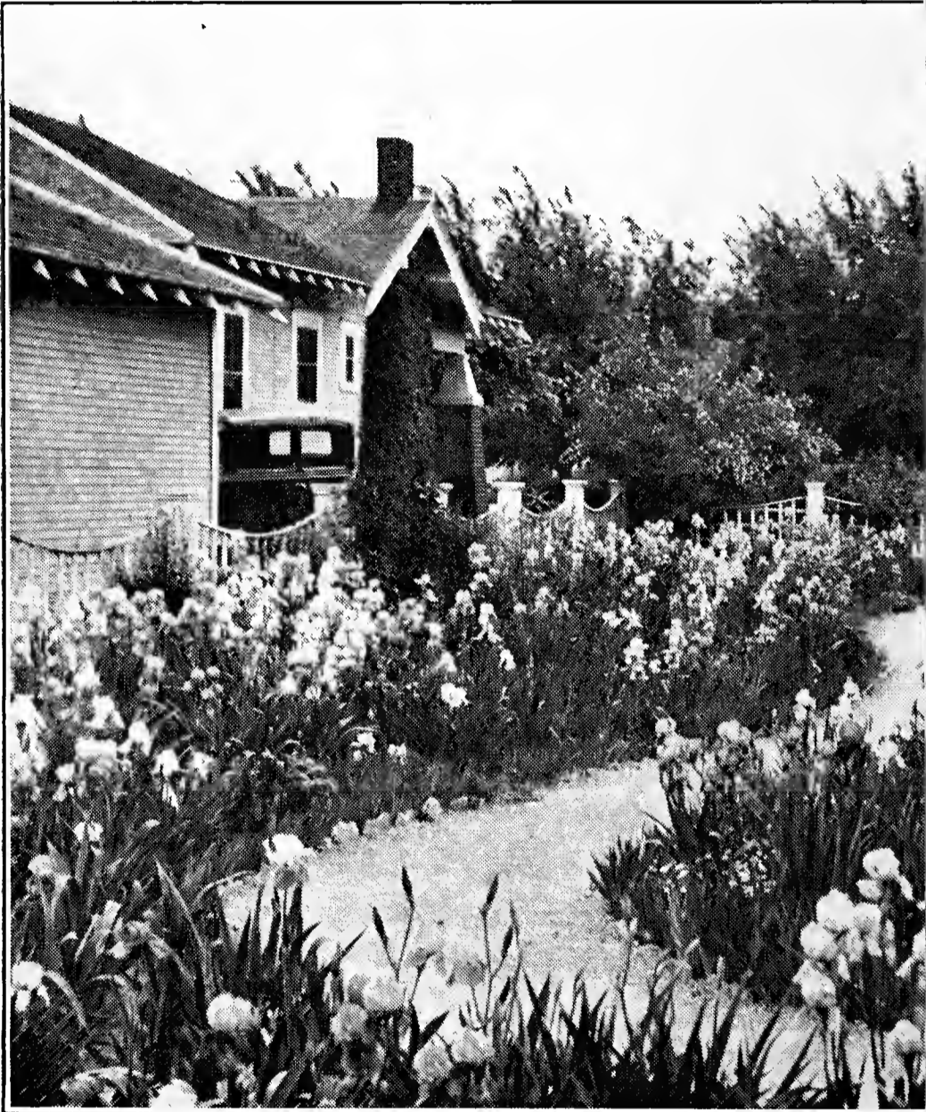
A GLIMPSE OF THE BEAUTY OF LINWOOD IRIS

MAJESTIC —The very name bespeaks its grandeur. A large flowered Dominion off-spring with beautiful flaring falls and a regal bearing. The broad standards are mauve overlaid bronze; F. velvety raisin purple of rich and lustrous finish. 30 in. Of rugged growth and fine habits. An Iris you will be proud to own. Each..... 10c